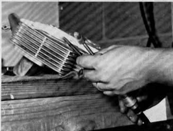
The two main heads used in the porting of a Honda head are shown above. These tools are a carbide cutter and a sanding head. The carbide cutter enables him to remove any burrs and rough casting left in the port. This is done through the intake port shown in photo at right.