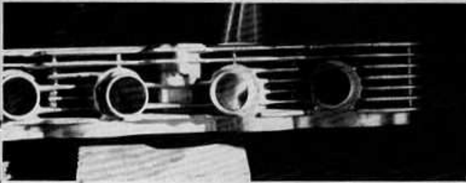
The #3 port actually shows the type of porting Steve likes to do. This port was ported and then glass beaded for quite an improvement. On the right, Steve shows off the various types of tools it takes to get into the smallest radius found in the different ports in motorcycle heads.