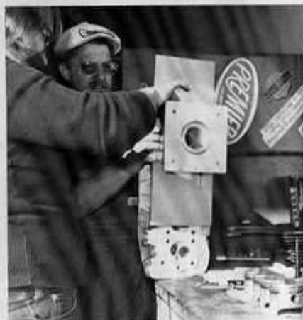
ABOVE—The base part of the flow bench is fabricated to duplicate the flow of air into the cylinder through the port. The most important part of installation is alignment.