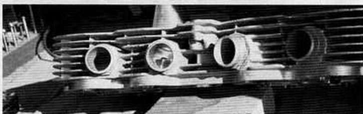
The #2 port on this Honda head was polished without porting. On the flow bench, the port actually flowed 2 cfm's less than a stocker!

port than right. This is especially true of the delicate balance which must be maintained between the cylinders of a multi-pistoned engine such as the fours. The next thing you are going to figure out is home porting is almost impossible since this balance has to be maintained. Cut too much metal out of the wrong place and you will run into jetting problems as well as creating that imbalance which will give you a lugging cylinder.