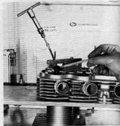
Flow bench operates by measuring amount of air that flows through port. Thus, intake valve has to be in place and depressed as if the engine were running.