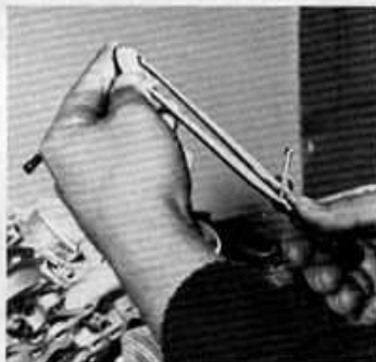
The port profile must be maintained for proper flow and performance. Here, the valve is being checked for size.